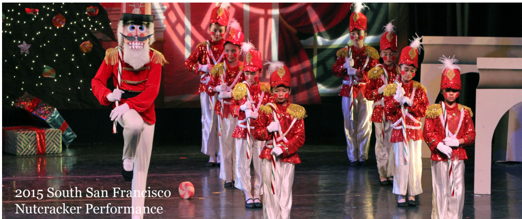
2015 South San Francisco Nutcracker Performance

The holidays are quickly approaching and the City of South San Francisco is full of activities to get you in the holiday spirit. We've got you covered from Santa visiting City Hall, to outdoor music, magical performances and workshops that will get your creative juices flowing.