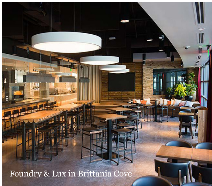
Foundry & Lux in Brittania Cove

The major Biotechnology campus, commonly referred to as “The Cove,” under construction at the corner of Oyster Point and Veterans Blvd., has opened its public amenity area. Foundry & Lux is a chic yet relaxed restaurant complex that includes a café for morning coffee and lighter fare, and a wide range of options in the main dining area for lunch. The space also offers free WiFi, two bowling lanes (including shoes!), a pool table, and outdoor bocce ball, ping pong, horseshoes, basketball and volleyball – all open to the public! “The Cove” will have seven biotech R&D buildings and an AC Marriott Hotel, which will have 185 rooms. The first phase of the project is complete. A nine-level parking garage is now under construction, which is anticipated to open in the second quarter of 2017.