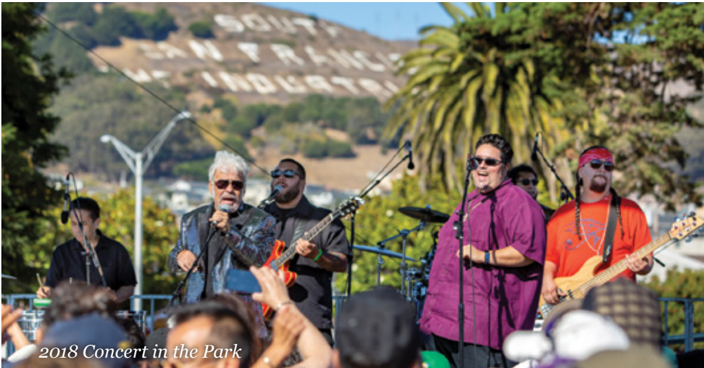
2018 Concert in the Park

Join South San Francisco Parks and Recreation Department for the fifth annual “Concert in the Park,” Saturday, September 28. This free event takes place at Orange Memorial Park from 11:00 a.m. - 4:30 p.m. Family and friends of all ages are encouraged to join in the festivities.