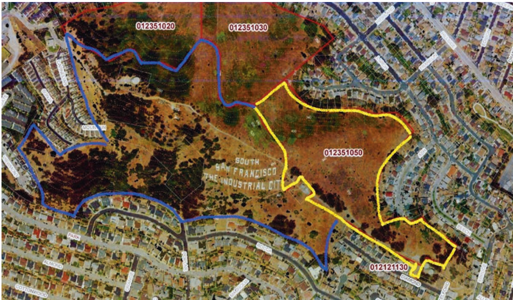
(Yellow indicates the newly acquired land; blue indicates what the City currently owns)

The city is celebrating the agreed acquisition of nearly 21 acres of land on Sign Hill, which following completion of the sale will be perpetually dedicated as open space for the public to enjoy. Recently the City Council approved terms to purchase a portion, and accept a large donation of land, on Sign Hill which had been zoned for residential development. Residents will soon have access to 65 acres of open space on Sign Hill.