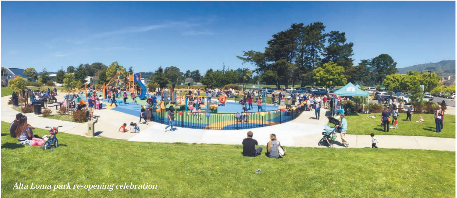
Alta Loma park re-opening celebration

This July, under the umbrella of the National Recreation and Park Association (NRPA), South San Francisco will celebrate Park and Recreation Month . This year's theme is "A Lifetime of Discovery," with the goal of encouraging residents to experience some of the "undiscovered" programs and amenities that the South San Francisco Parks and Recreation Department has to offer, and showing the community that A Lifetime of Discovery awaits you at our local parks and rec centers.