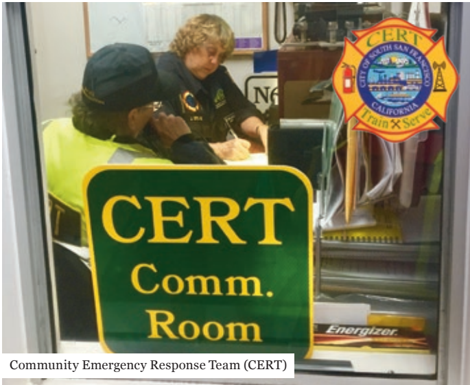
Community Emergency Response Team (CERT)

The January 4th magnitude 4.4 earthquake was a wake-up call for many, and was reportedly felt by 9.8 million Californians as far north as Marin County and as far south as Santa Cruz County. Now is the time for all South San Francisco residents to be prepared, involved, and informed!