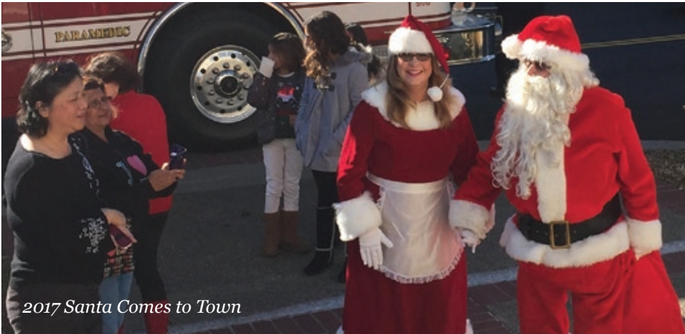
2017 Santa Comes to Town

Santa Comes to Town is quickly approaching! Santa will make his annual visit on Saturday, December 1, from 11:00 a.m. to 3:00 p.m. at City Hall, 400 Grand Avenue, South San Francisco.