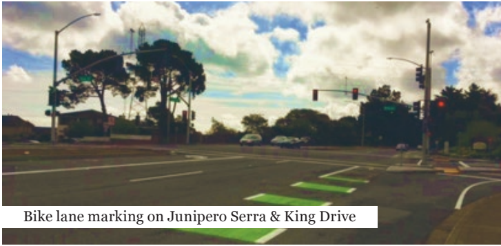
Bike lane marking on Junipero Serra & King Drive

With the support of an $849,000 federal Highway Safety Improvement Program grant, the City's Public Works Department completed a number of vehicle, bicycle, and pedestrian safety improvements to Junipero Serra Boulevard at the King Drive intersection.