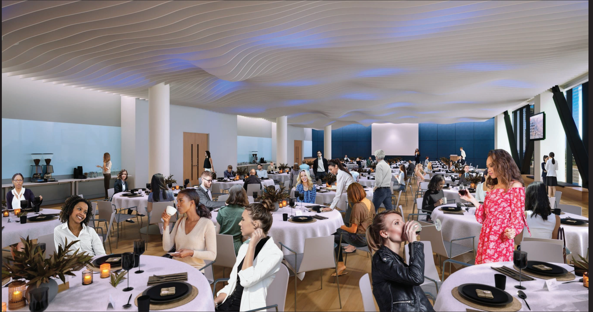
LARGE EVENT SPACE