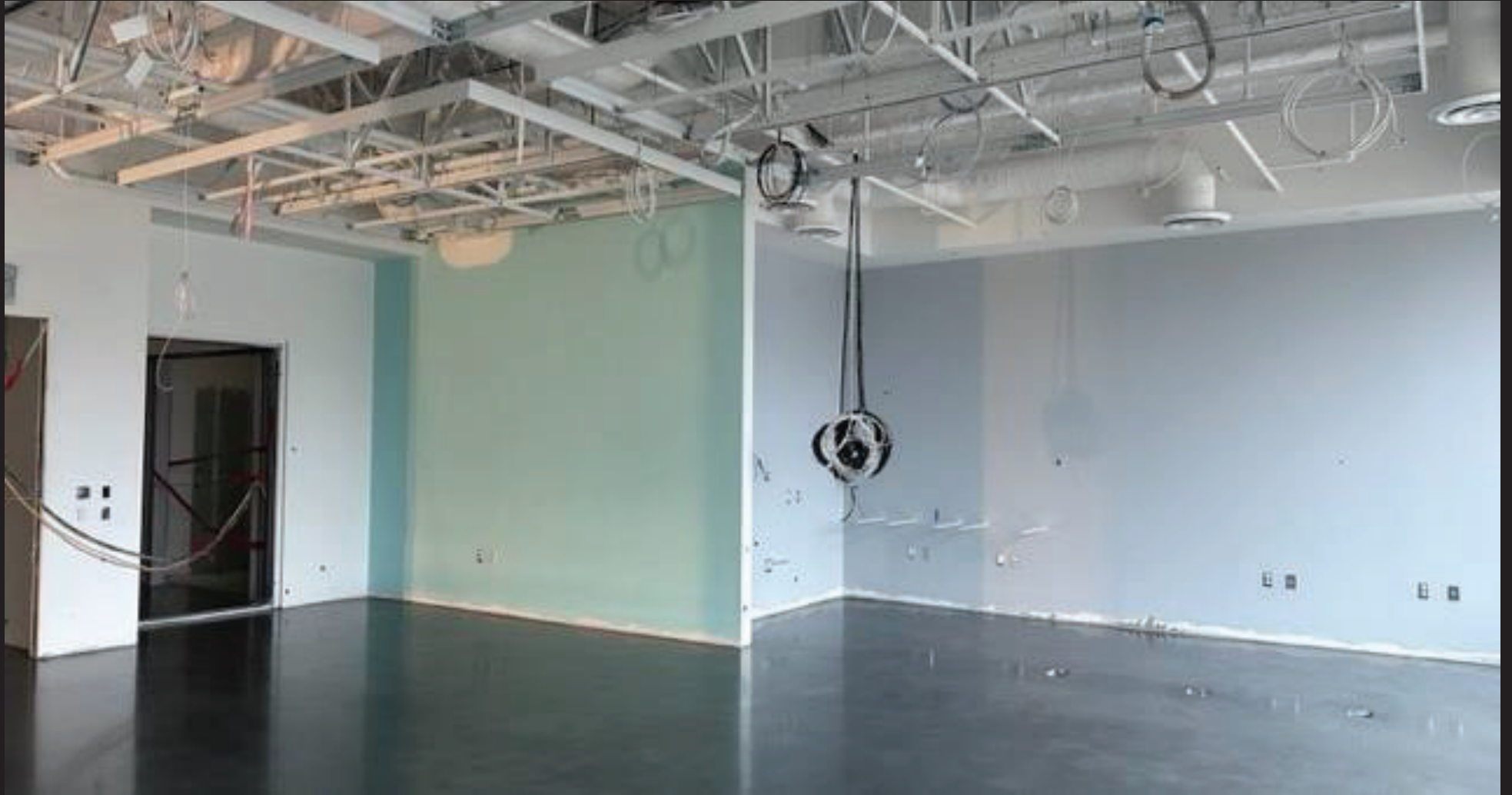
DISCOVERY CENTER – MAKER SPACE