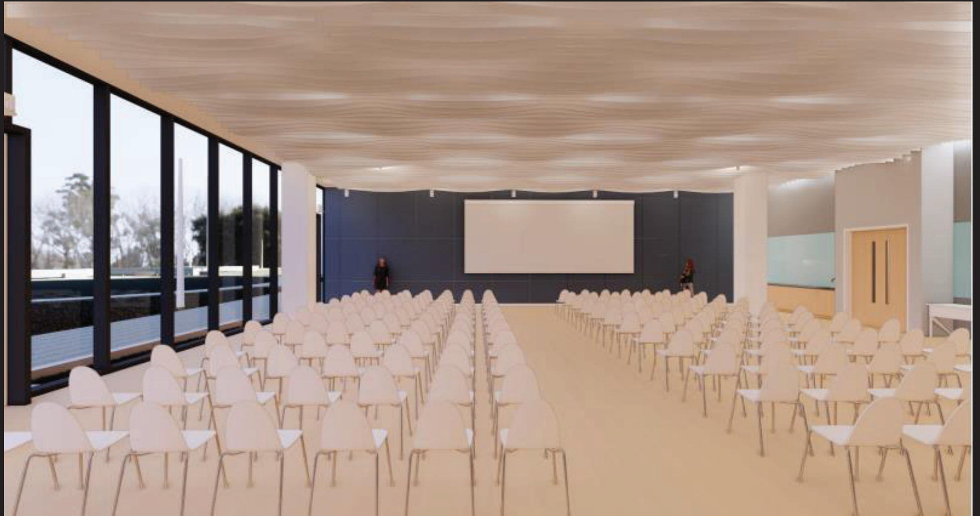
MEDIUM EVENT SPACE