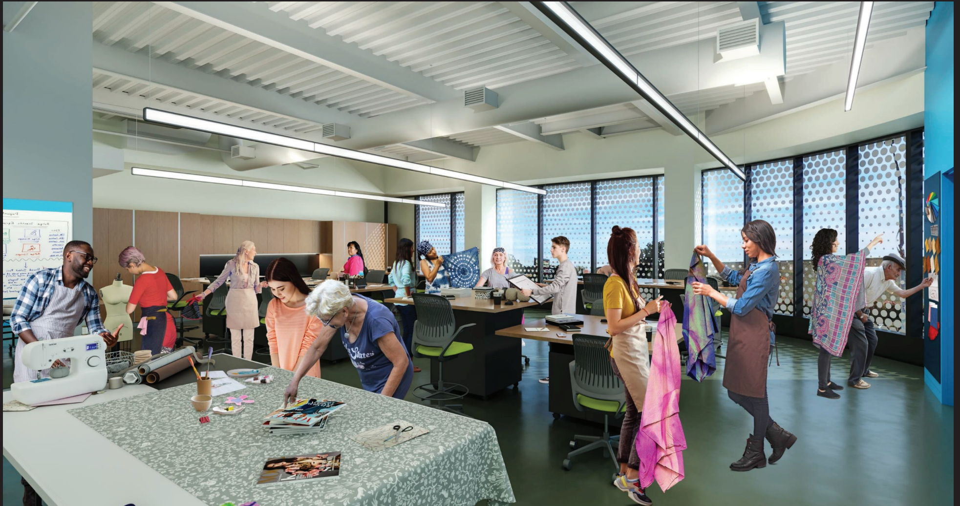
ART ROOM / CREATOR'S STUDIO