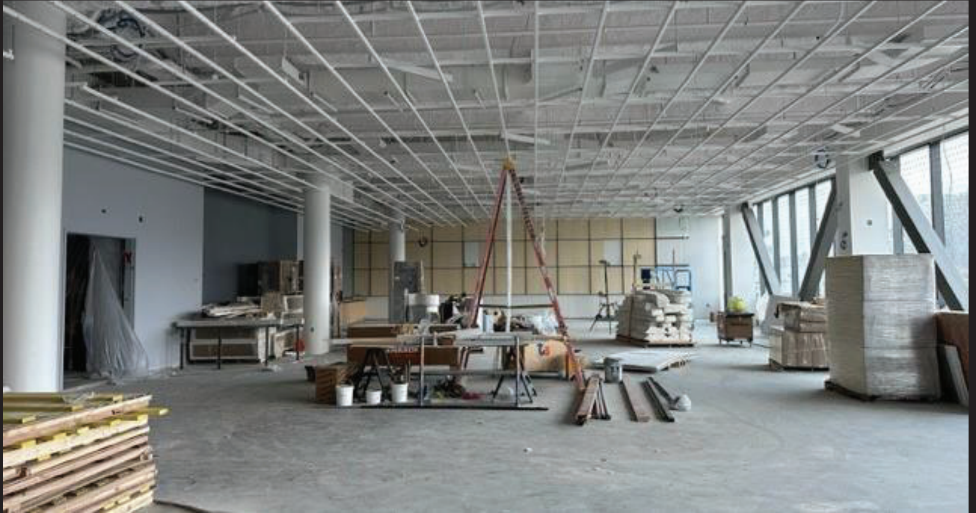
LARGE EVENT SPACE