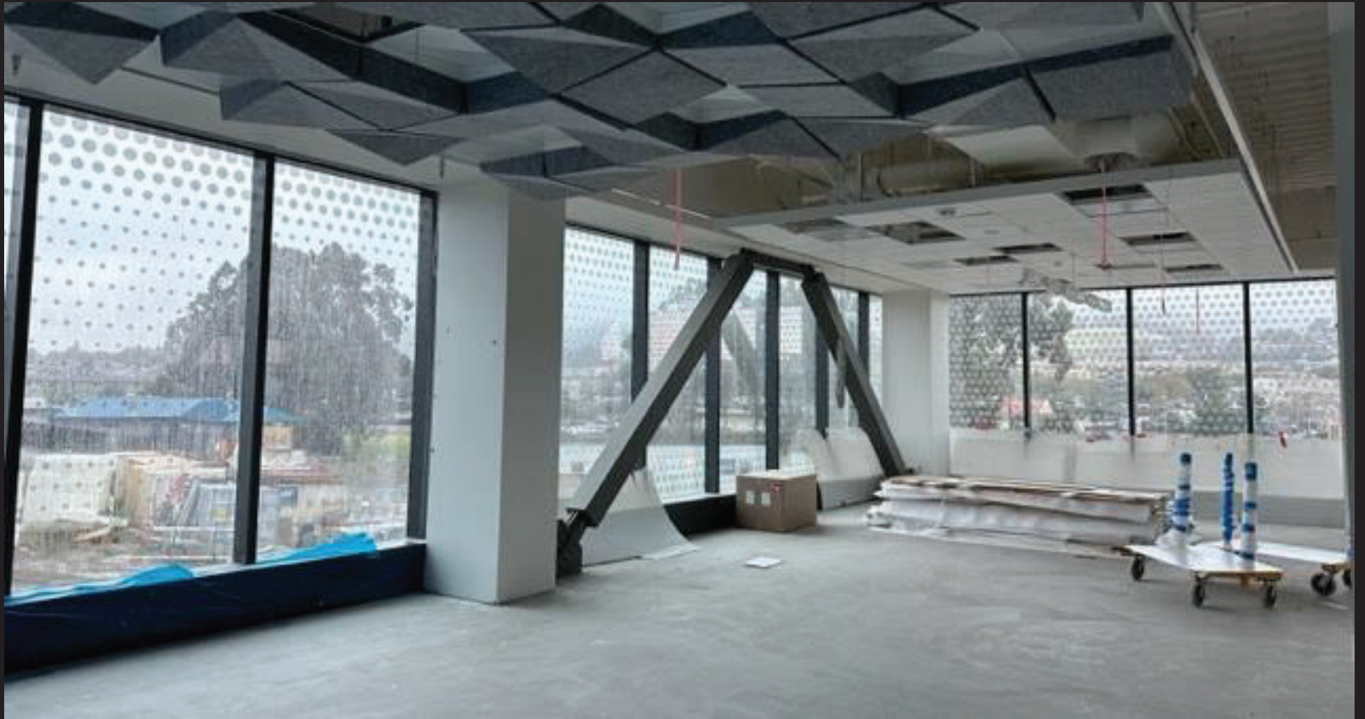
LIBRARY – YOUNG ADULT AREA