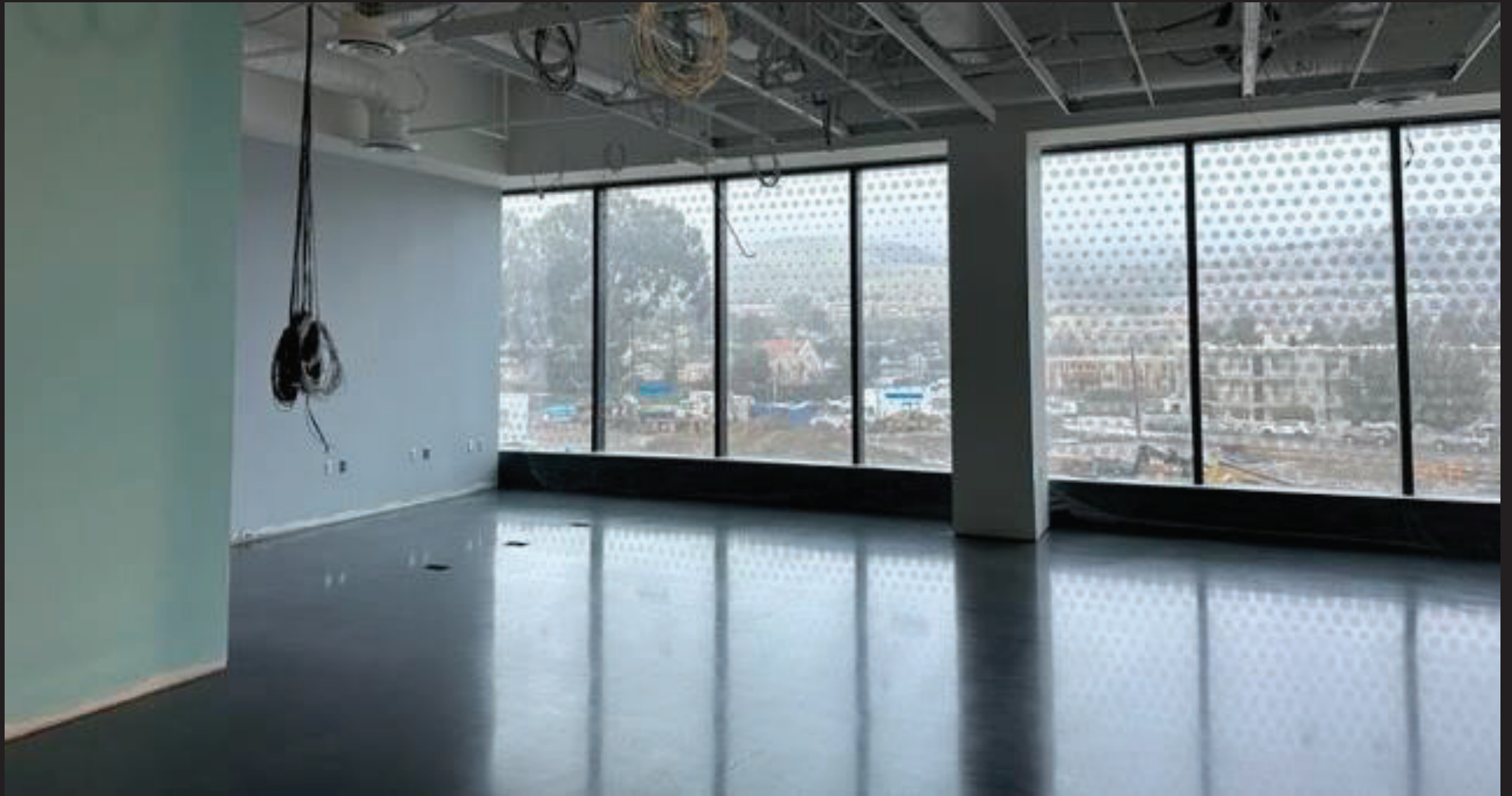
DISCOVERY CENTER – MAKER SPACE