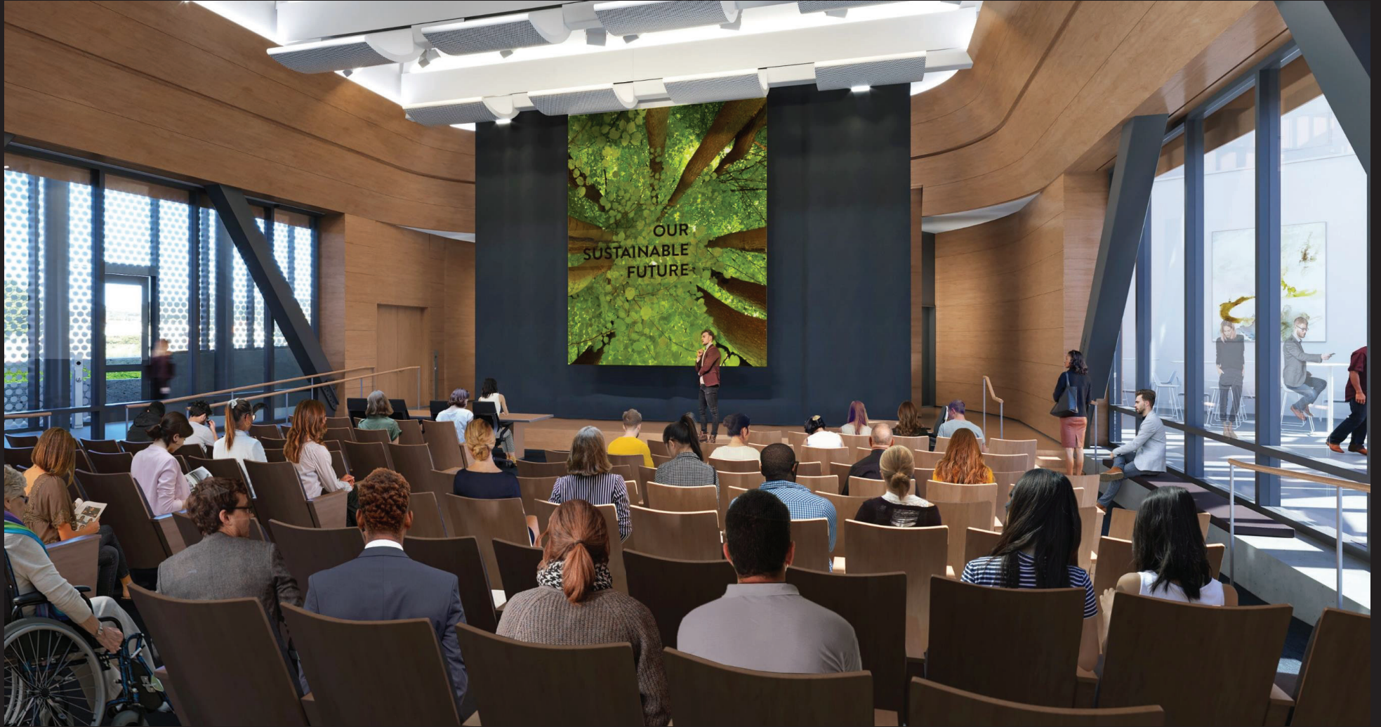
CITY COUNCIL CHAMBER / THEATER INTERIOR