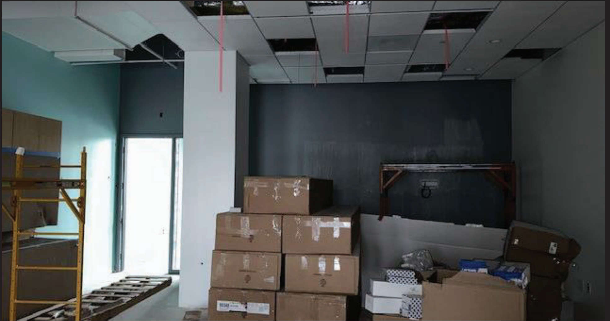
DISCOVERY CENTER – DIGITAL STUDIO