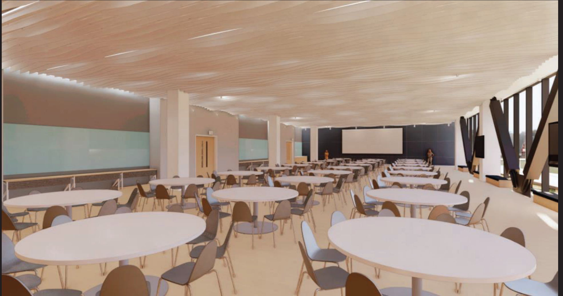
LARGE EVENT SPACE