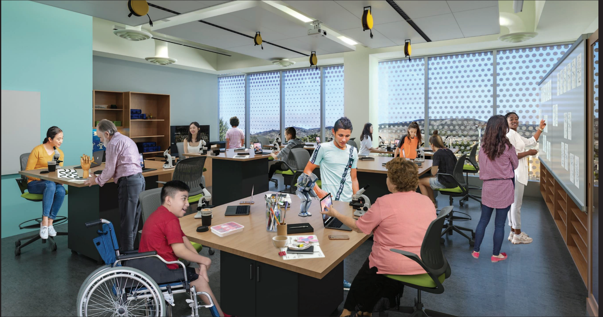
DISCOVERY CENTER – MAKER SPACE