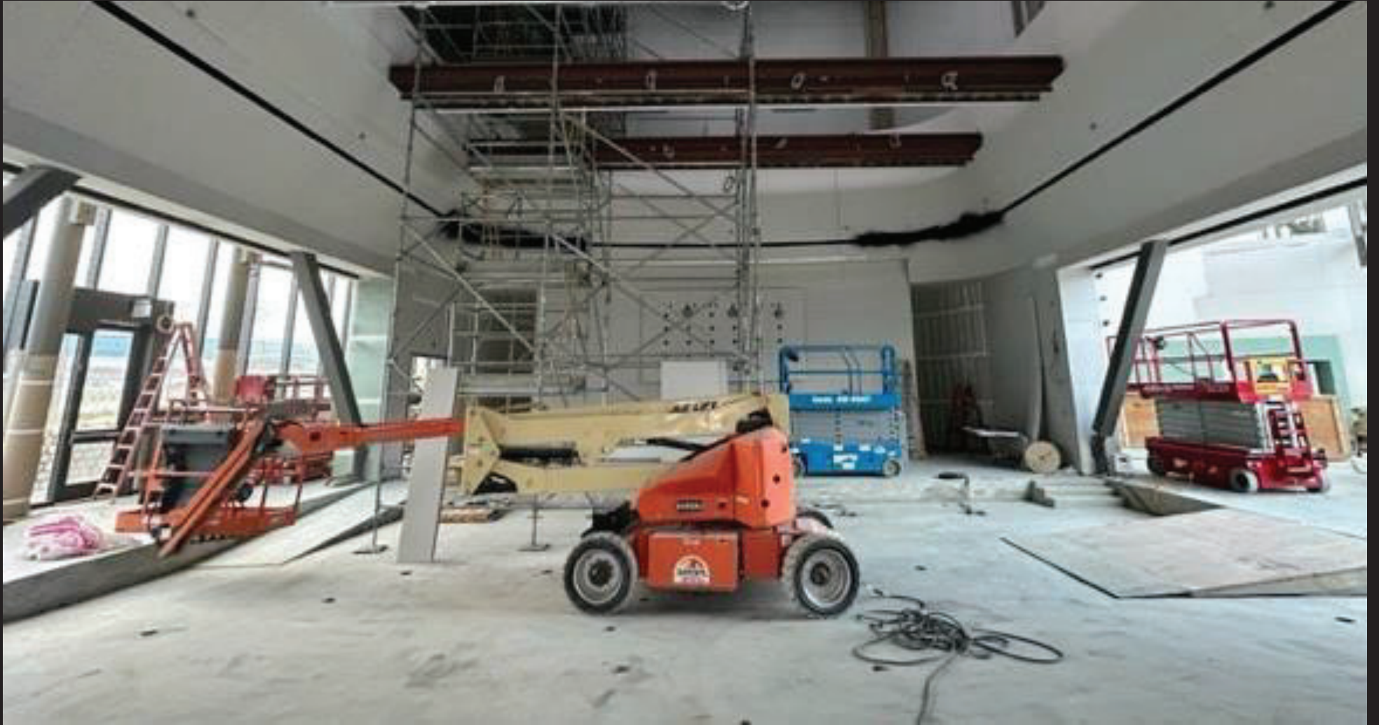
CITY COUNCIL CHAMBER / THEATER INTERIOR