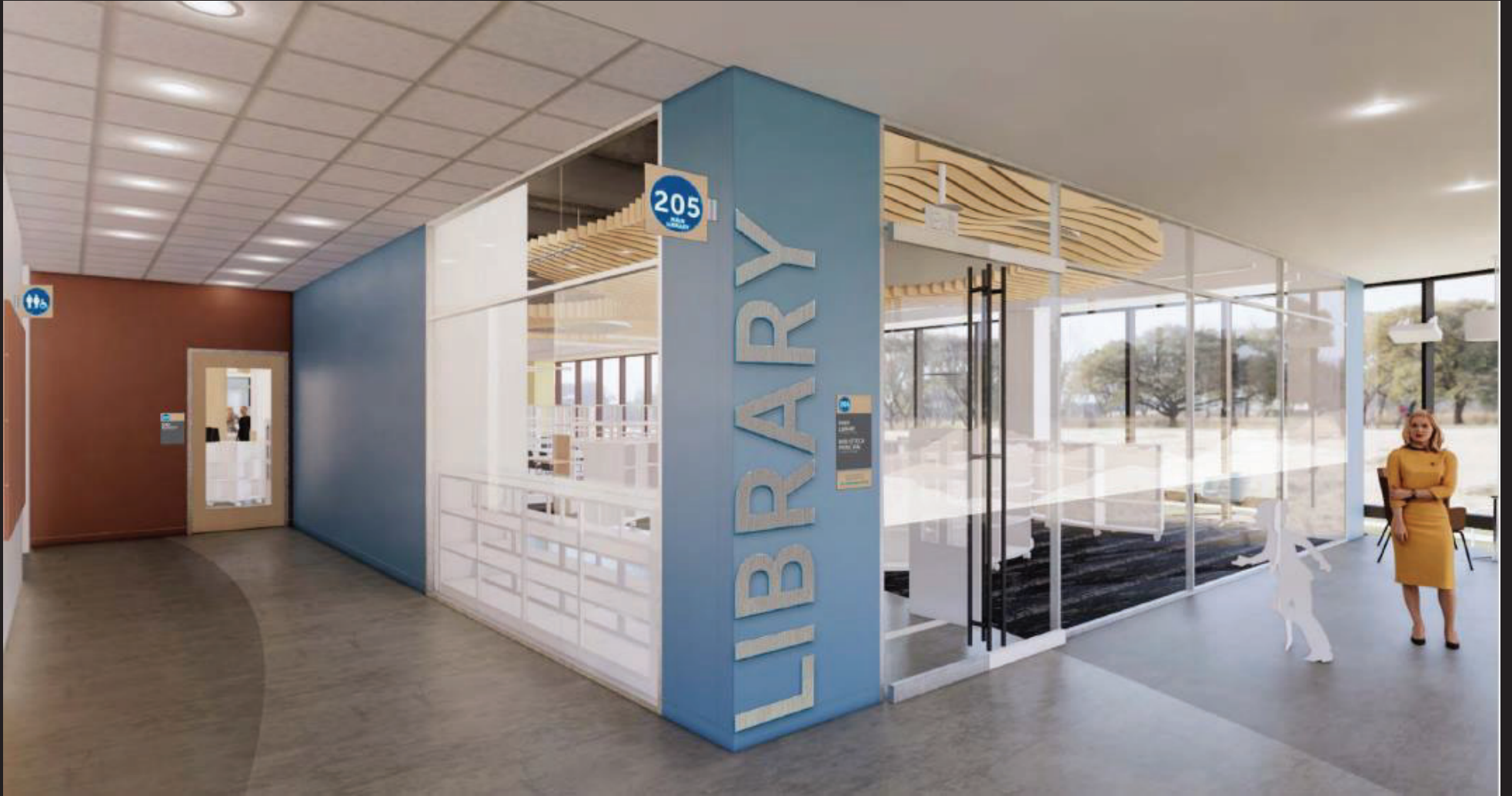
THIRD FLOOR ADULT LIBRARY ENTRANCE