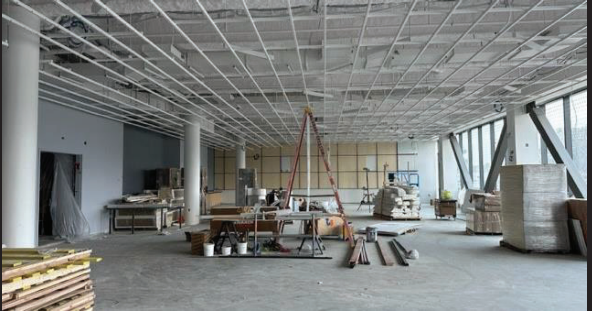
LARGE EVENT SPACE