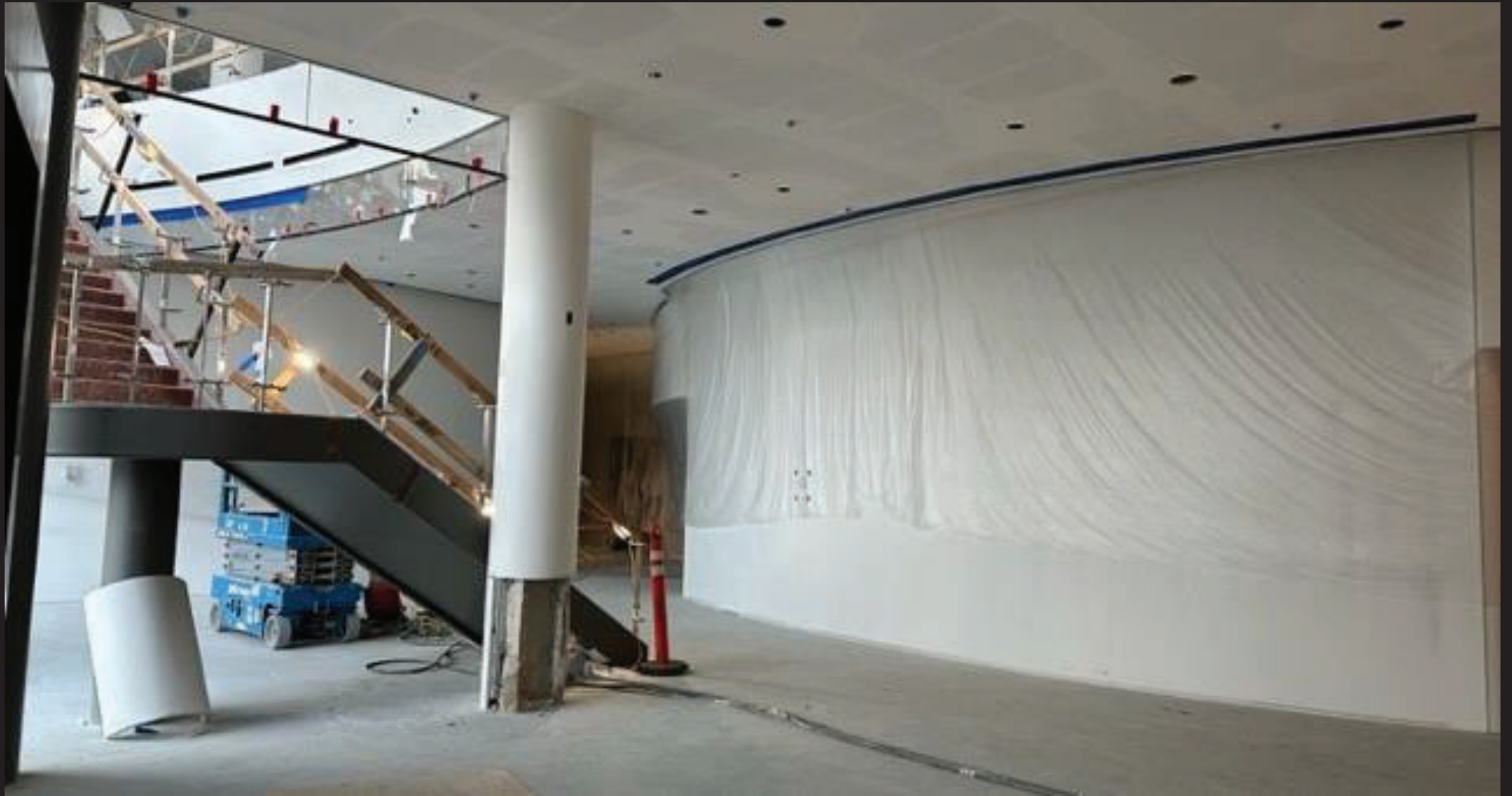
FIRST FLOOR LOBBY