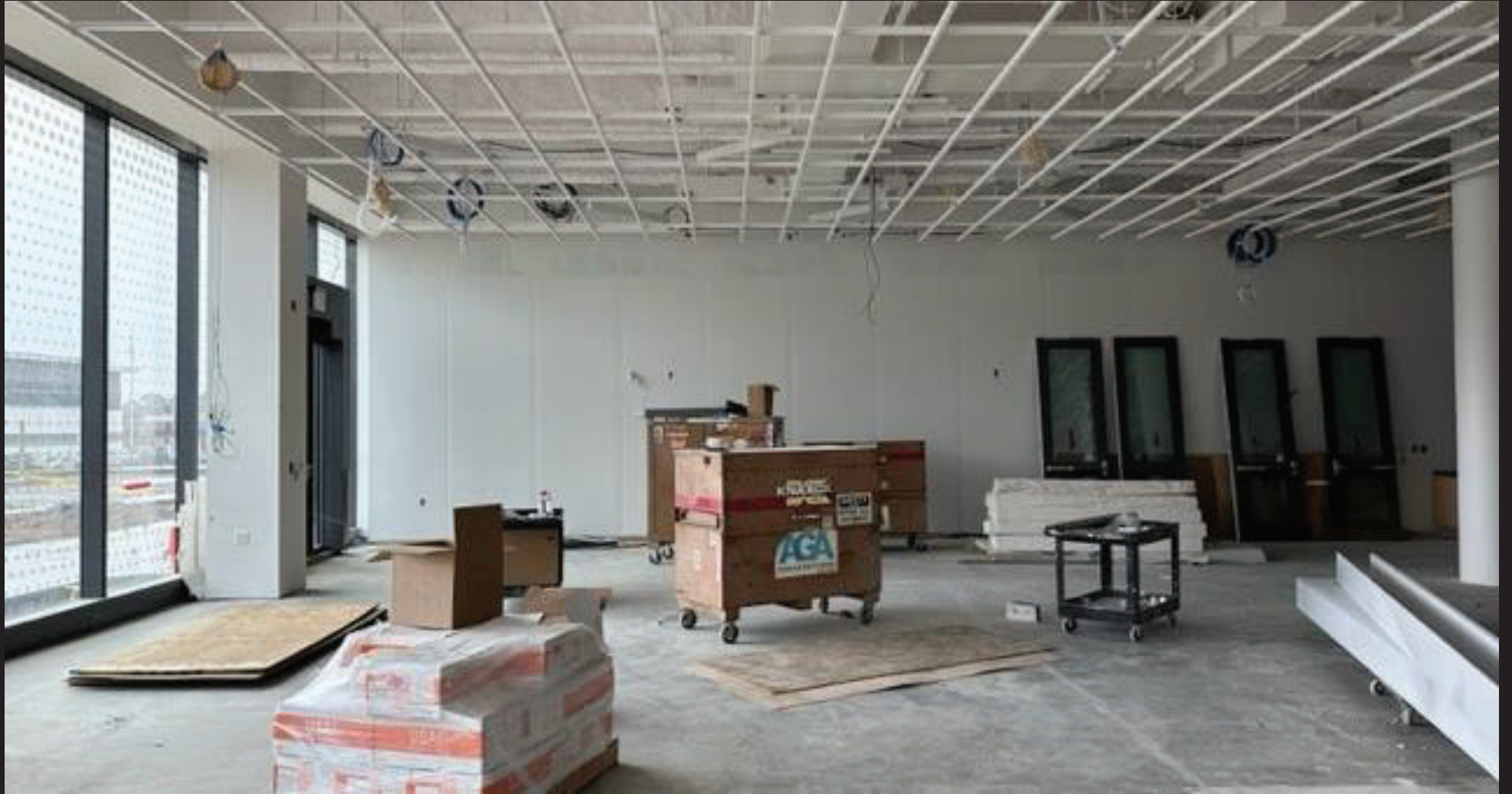
MEDIUM EVENT SPACE