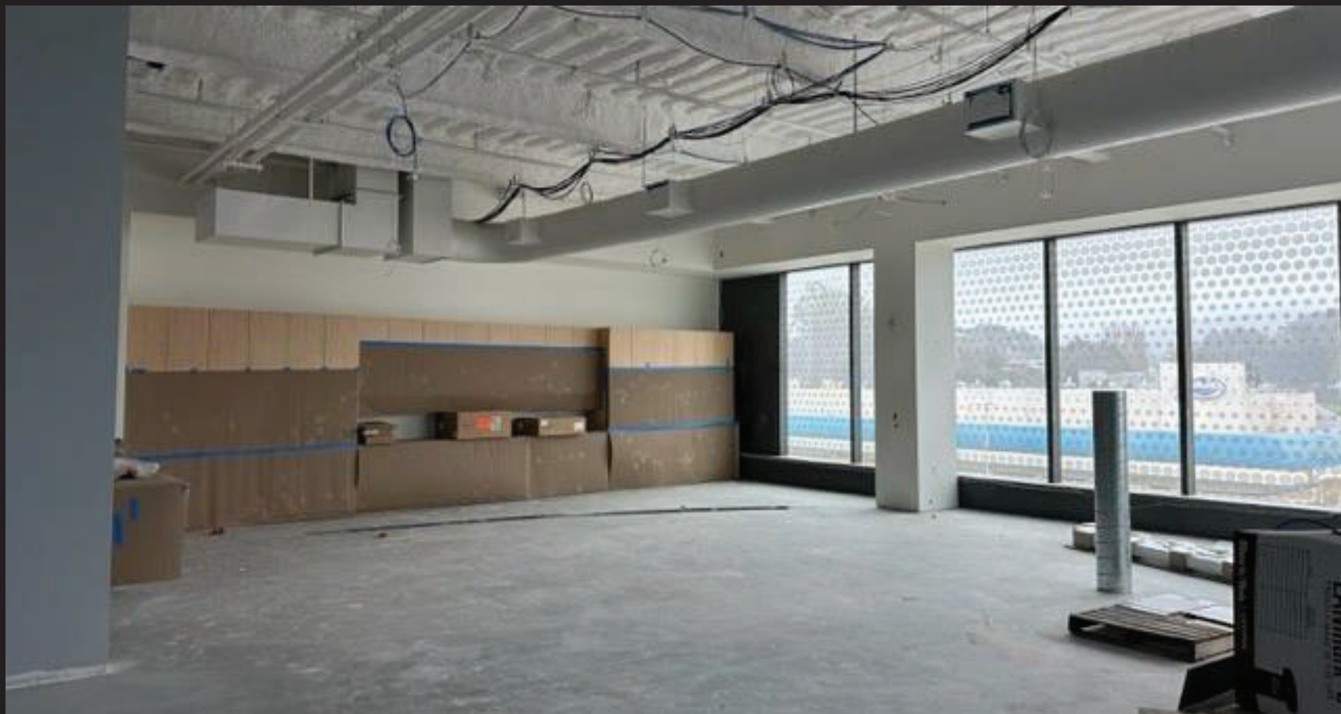
ART ROOM / CREATOR'S STUDIO