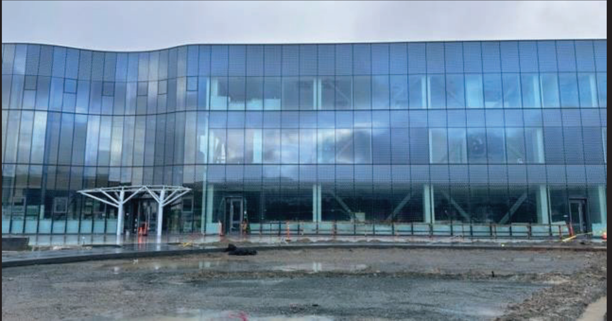
VIEW FROM FIELD