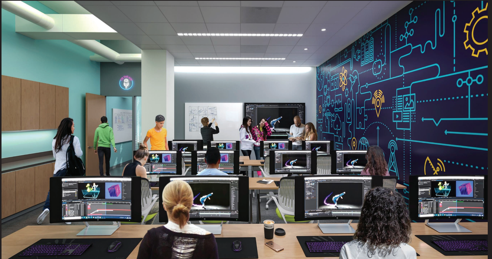
DISCOVERY CENTER – DIGITAL STUDIO