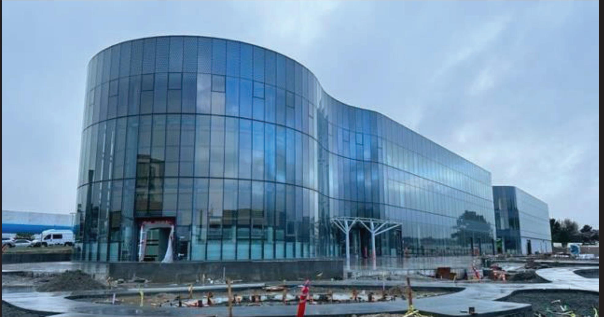
EXTERIOR VIEW FROM PARK