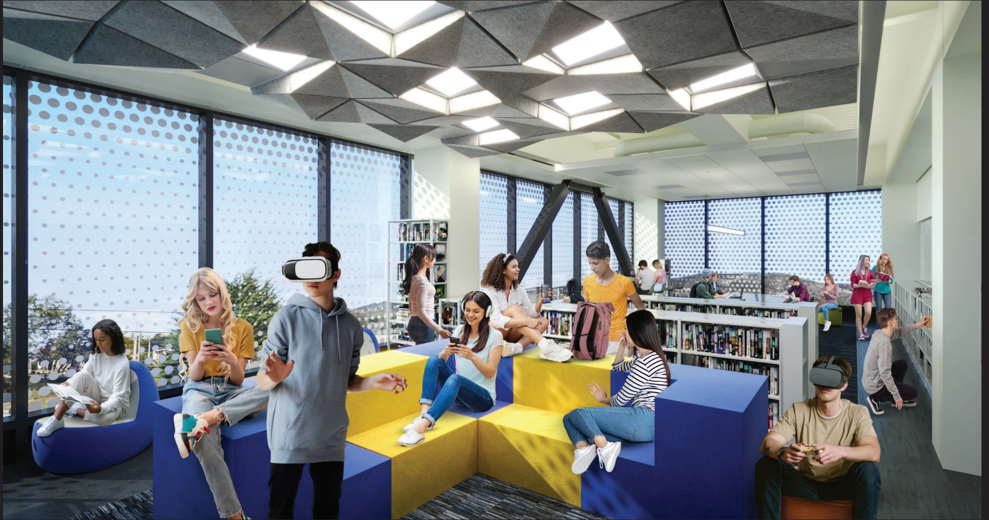
LIBRARY – YOUNG ADULT AREA