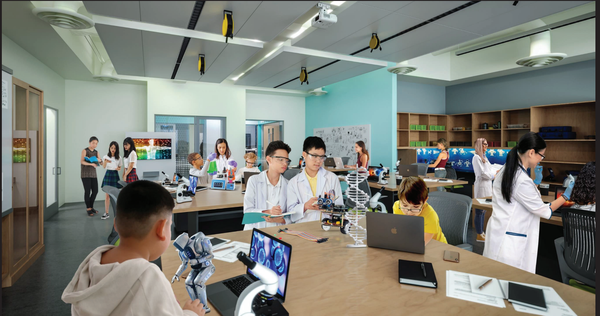
DISCOVERY CENTER – MAKER SPACE