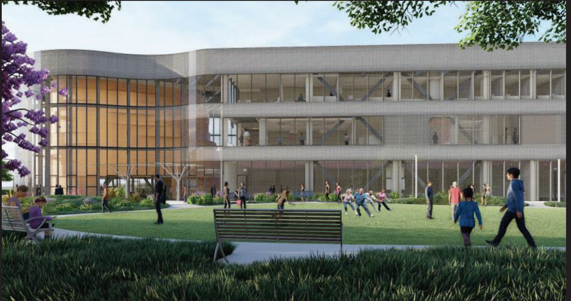
VIEW FROM FIELD