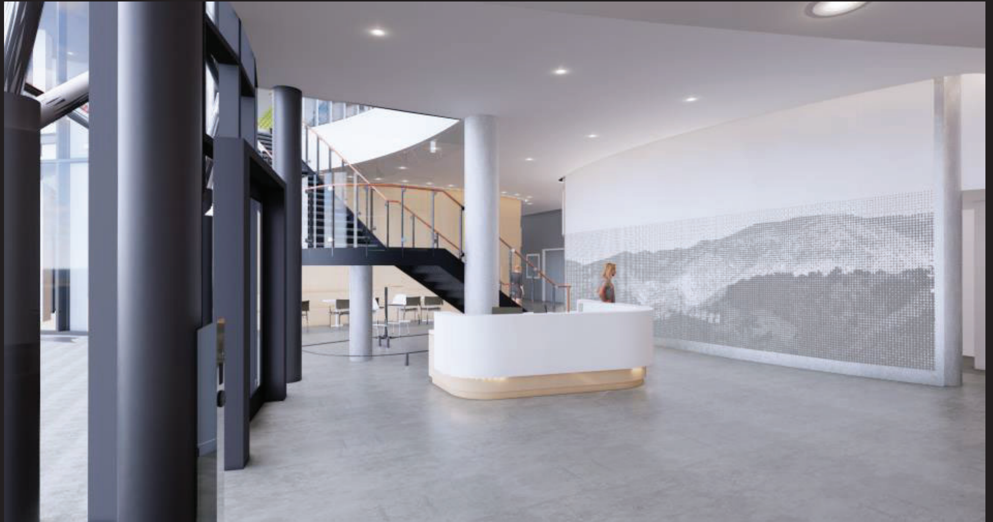
FIRST FLOOR LOBBY