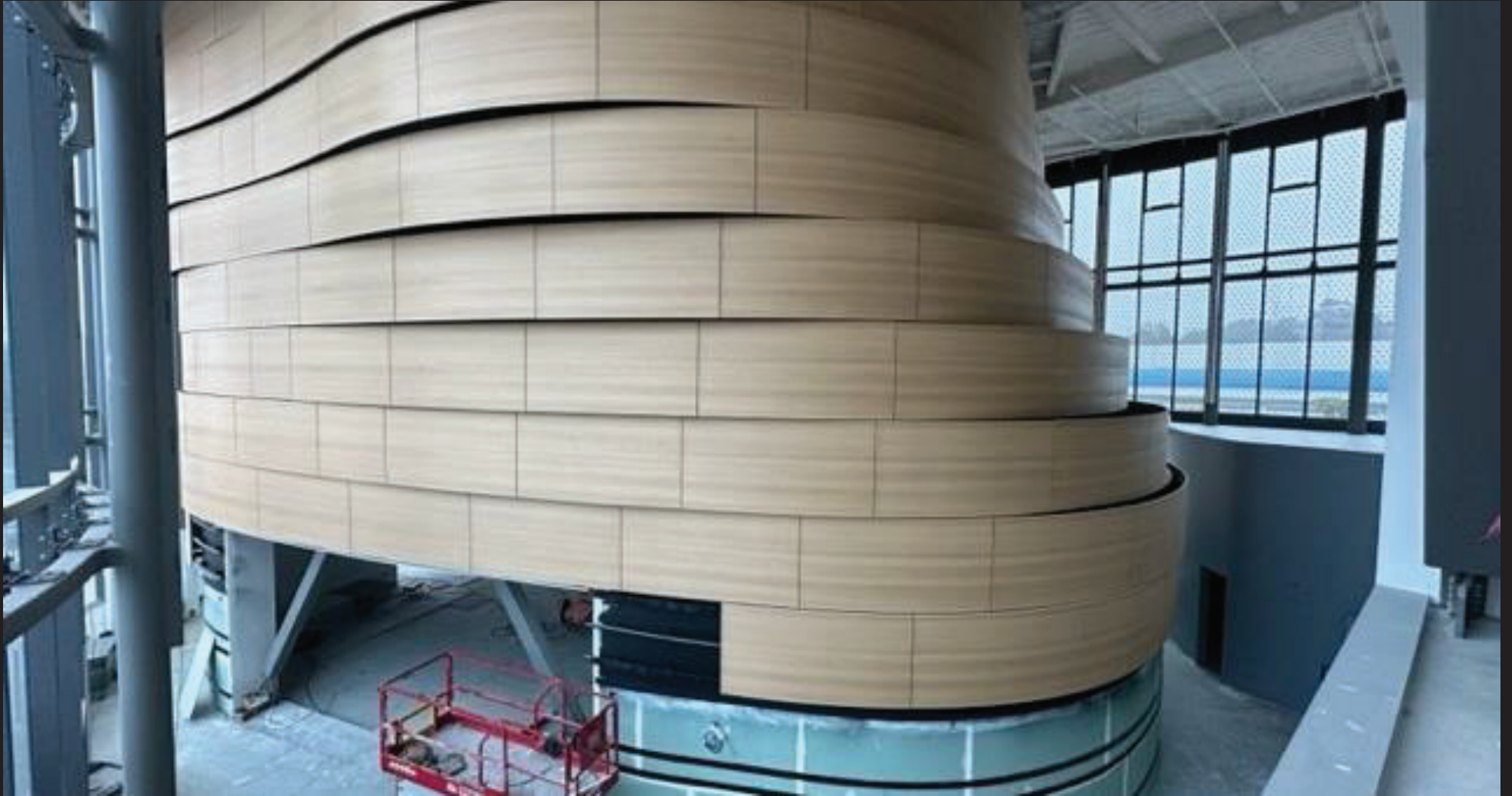
COUNCIL CHAMBER / THEATER EXTERIOR FROM SECOND FLOOR