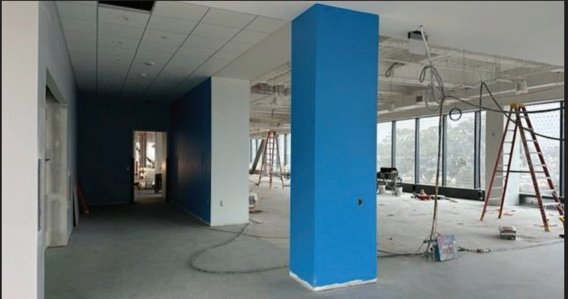
THIRD FLOOR ADULT LIBRARY ENTRANCE