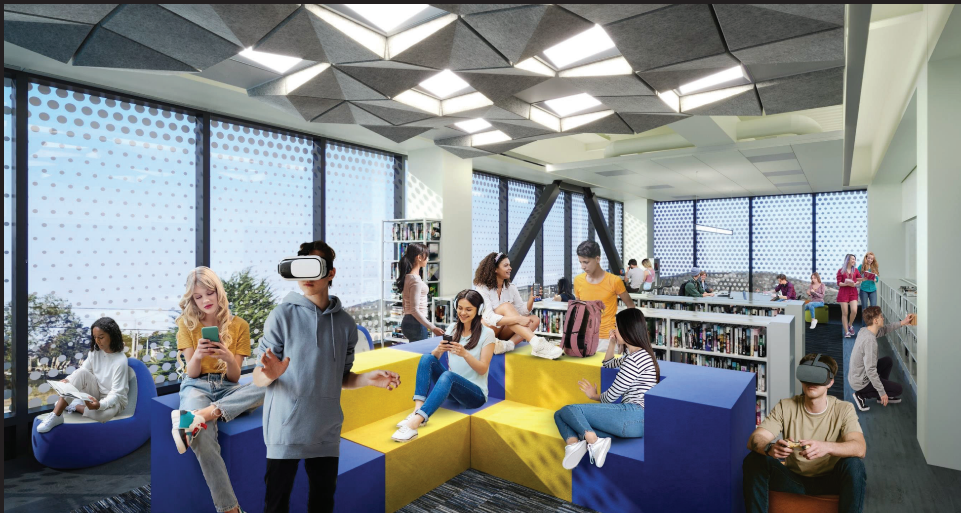
LIBRARY – YOUNG ADULT AREA