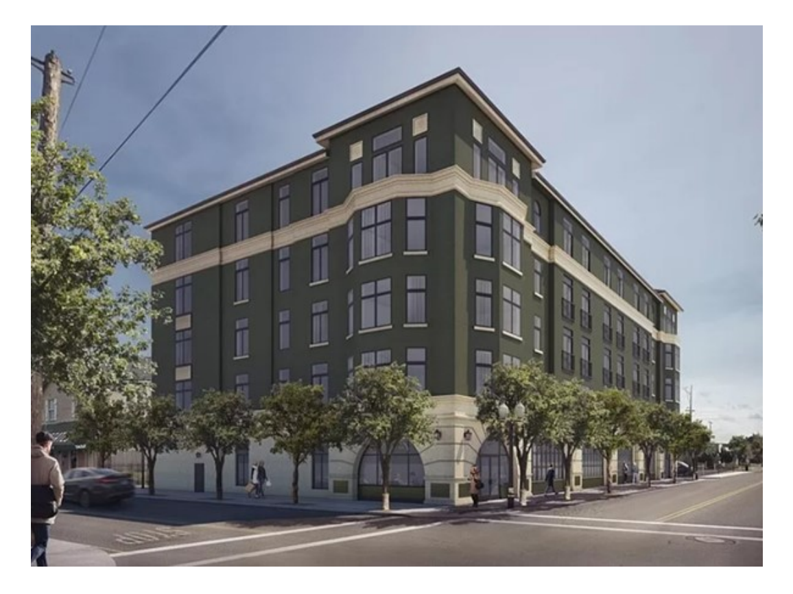
Grand and Linden Family Apartments: 418 Linden Avenue

The State of California certified the City of South San Francisco's adopted Housing Element, finding it in compliance with State Law. The certification means South City is doing our part to address the housing crisis and ensure that all our families have a safe and stable place to live.