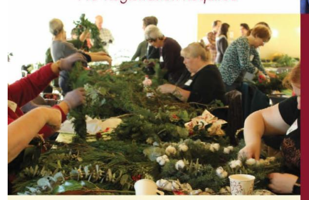
Our workshop leaders will provide all the basic materials needed, along with hands-on instruction.