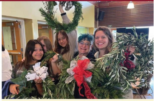
Create a gorgeous natural holiday wreath with fresh materials!