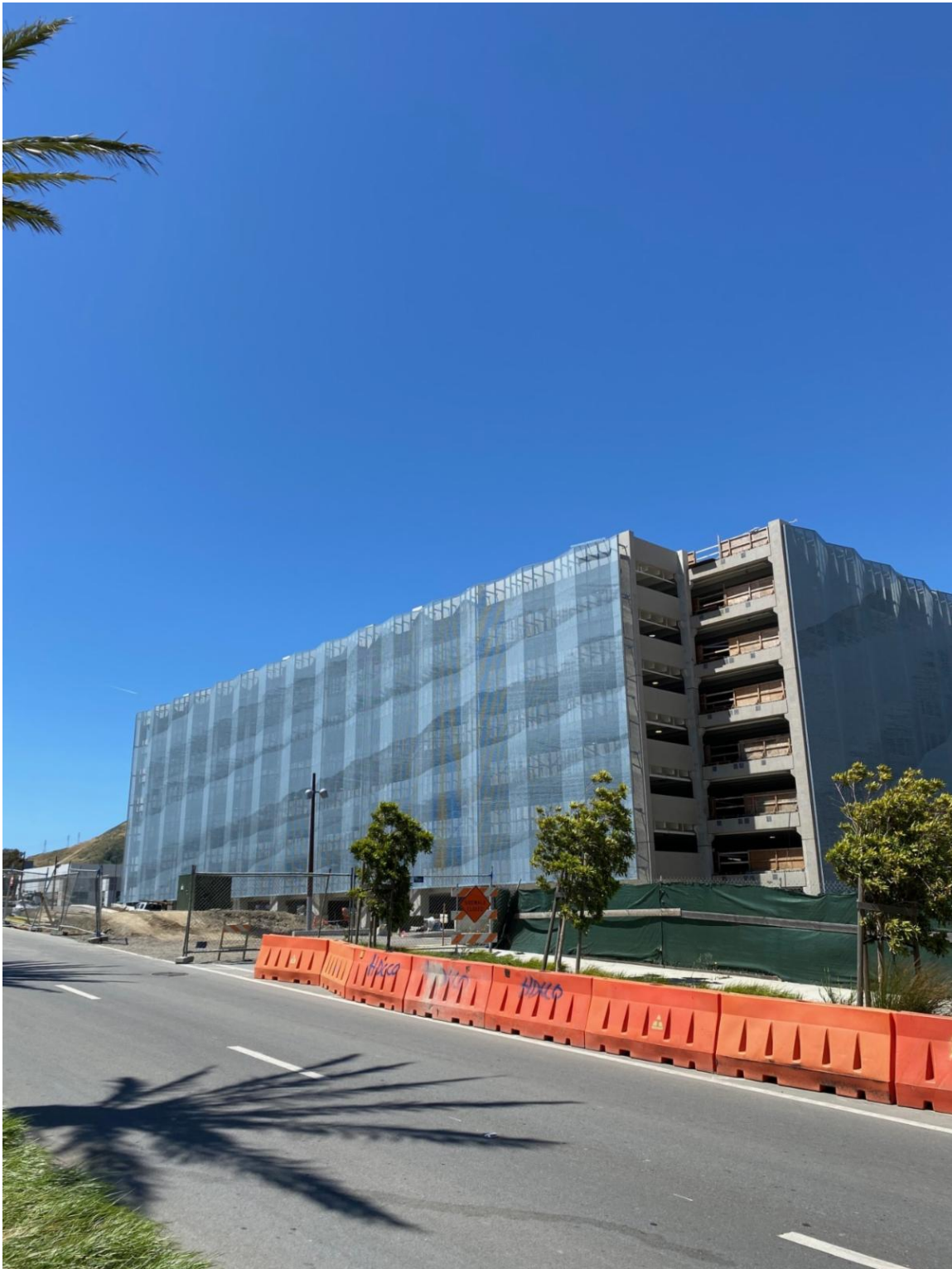
PG&E SUBSTATION (Gateway Boulevard between E. Grand Avenue and Oyster Point Boulevard)

The Oyster Point boat launch, fishing pier, and public bathrooms will remain open during construction. The Windsurf launch ramp will remain closed.