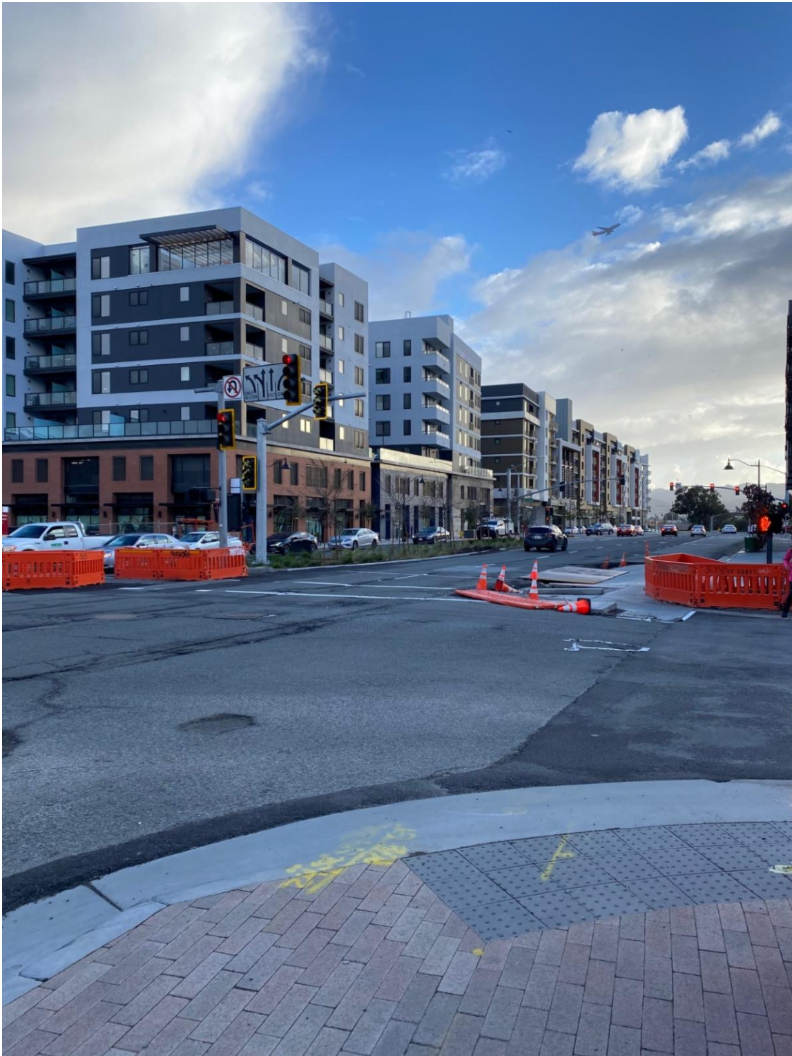
PG&E SUBSTATION (Gateway Blvd between E. Grand Ave and Oyster Point Blvd)

Commuters are encouraged to use alternate routes. Construction flaggers will be deployed to help maintain vehicular travel when necessary. Pedestrian detour signage will be deployed, routing pedestrians around the work zones. Pedestrian access to Caltrain Station is maintained. Please always follow the signs and safety personnel instructions.