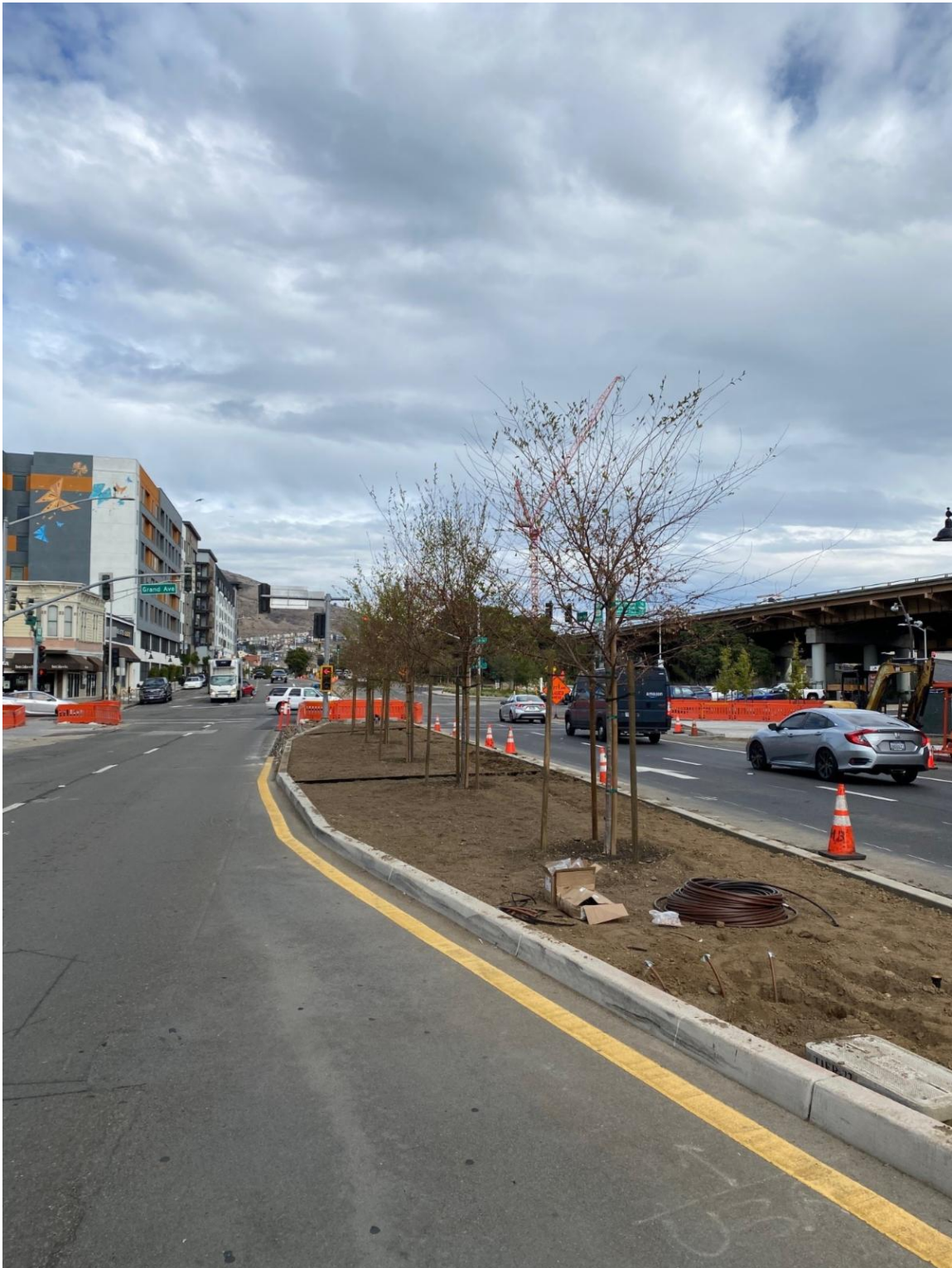
PG&E SUBSTATION (Gateway Blvd between E. Grand Ave and Oyster Point Blvd)

Commuters are encouraged to use alternate routes. Construction flaggers will be deployed to help maintain vehicular travel when necessary. Pedestrian detour signage will be deployed, routing pedestrians around the work zones. Pedestrian access to Caltrain Station is maintained. Please always follow the signs and safety personnel instructions.