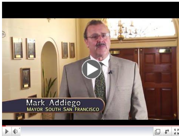
Welcome to South San Francisco, City of Industry and Innovation!