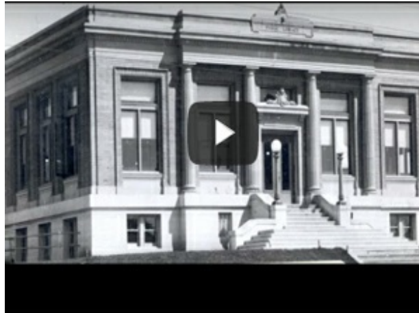
Just Imagine...A Tour of South San Francisco's Grand Avenue Branch Library Renovation