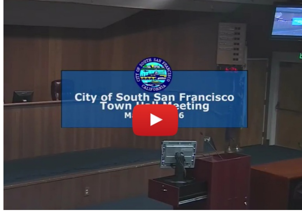
Miss the Public Safety Town Hall meetings? Watch on our YouTube Channel!