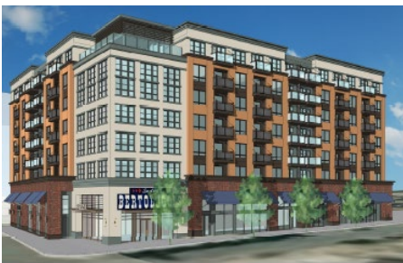
421 Cypress, Multi-Family Residential, Entitled 2022

Sample projects that have been recently reviewed by the DRB and are entitled, under construction, or completed