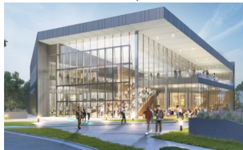
Vantage Amenity Building, Entitled 2022, recently completed construction